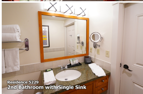
Residence 5229 2nd Bathroom with Single Sink