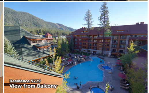
Residence 5229 View from Balcony