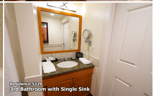
Residence 5229 3rd Bathroom with Single Sink