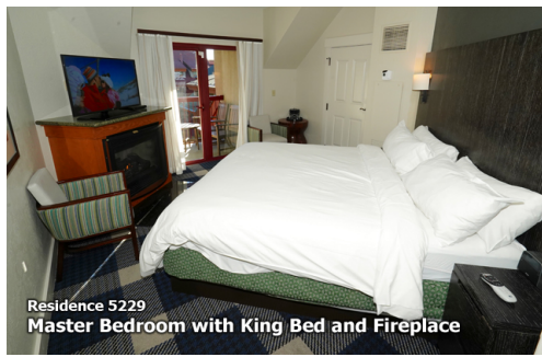
Residence 5229 Master Bedroom with King Bed and Fireplace