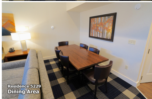
Residence 5229 Dining Area