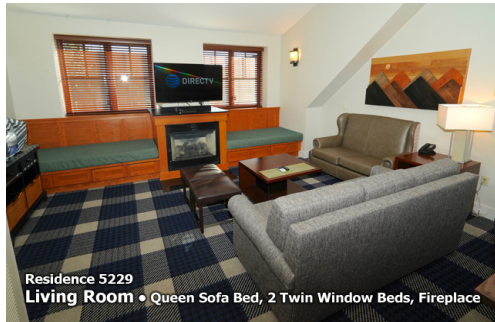
Residence 5229 Living Room • Queen Sofa Bed, 2 Twin Window Beds, Fireplace

Residence # 5229 2 Bedroom 3 Bathroom Loft Sleeps 8-10 - approx 1510 sq. ft. 1 King Bed, 1 Queen Bed, 2 Queen Sofa Beds, 2 Twin Window Beds, Balcony