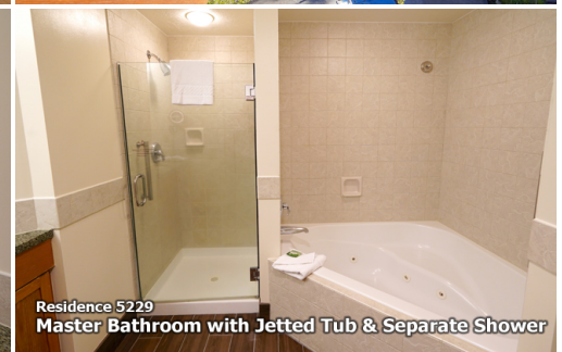
Residence 5229 Master Bathroom with Jetted Tub & Separate Shower