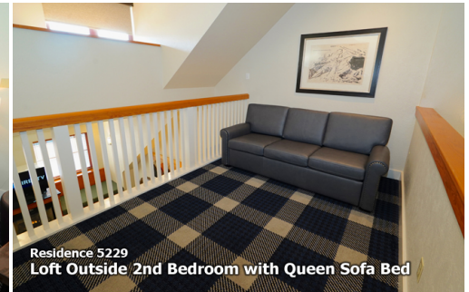
Residence 5229 Loft Outside 2nd Bedroom with Queen Sofa Bed