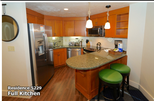
Residence 5229 Full Kitchen