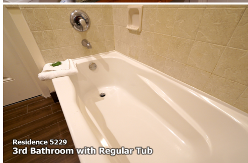
Residence 5229 3rd Bathroom with Regular Tub