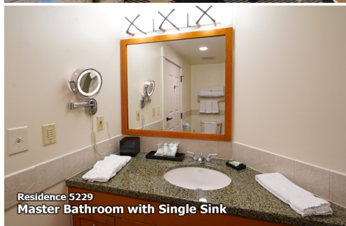
Residence 5229 Master Bathroom with Single Sink