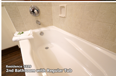
Residence 5229 2nd Bathroom with Regular Tub